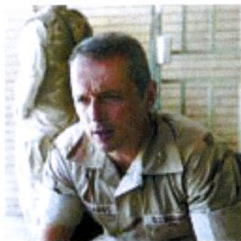
Col. Bogdanos.

$40/ROM members $35 Includes light refreshments. Pre-registration required.